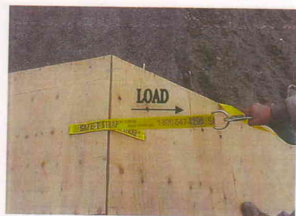
TEST 1 Load Perpendicular to nailed strap

Ensuring Safety through Engineering Test Direction