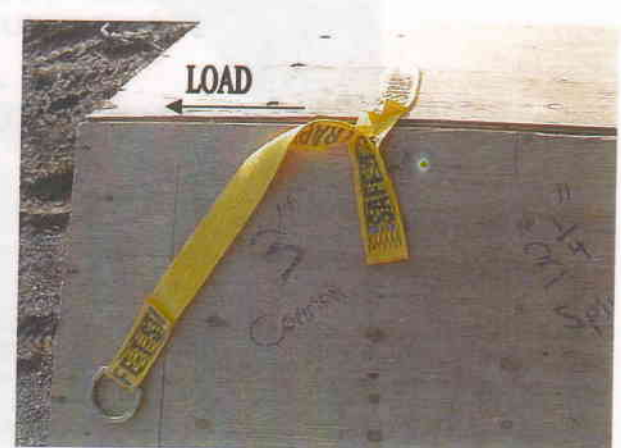
TEST 2 Load Parallel to nailed strap